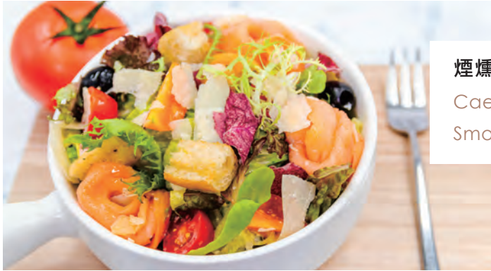
煙燻鮭魚凱薩沙拉 🐟 🥛 🌾 🥜